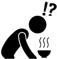
Change in Sense of Smell or Taste