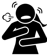
Shortness of Breath