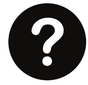
Any New Onset of Symptoms

If you experience any of the above symptoms, call ahead to your healthcare provider for guidance.